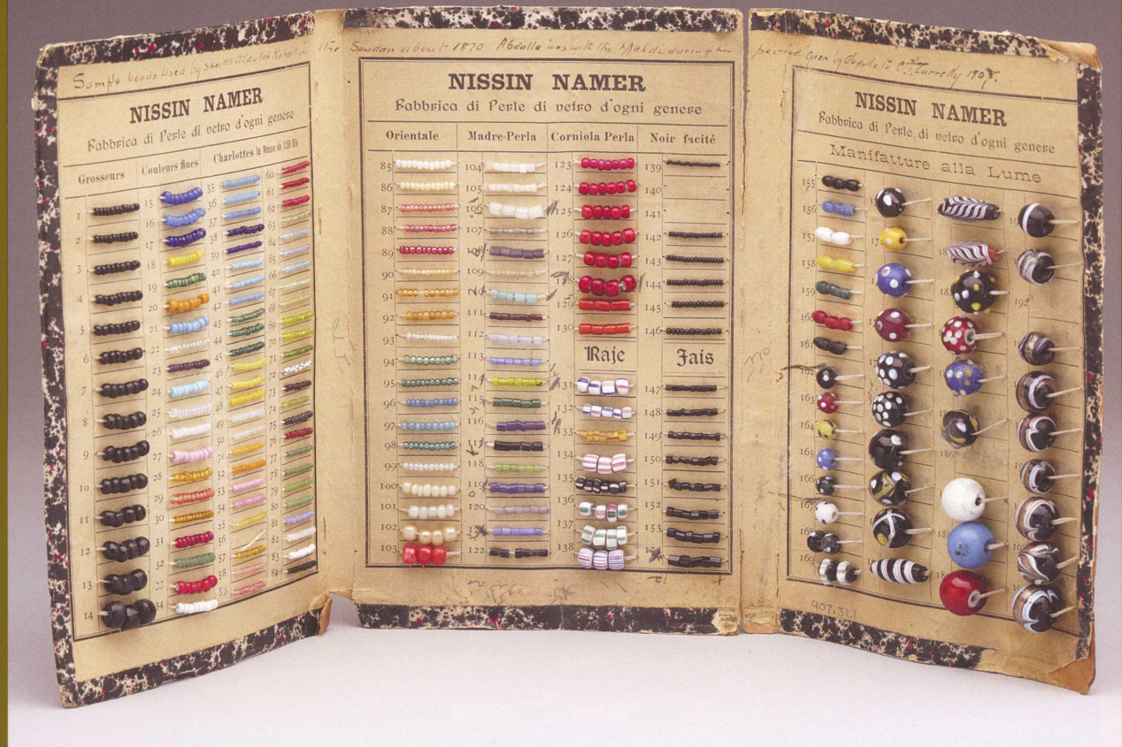
Plate XA. Red-on-White: Nissin Namer bead sample card from the Sudan, ca. 1870; ROM Accession 907.31.11.