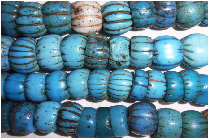
Plate IA. Tani: Top: Small Tani melon beads. D: 10 mm; L: 6.5 mm. Bottom: Large melon beads. D: 20-22 mm; L: 18-20 mm.