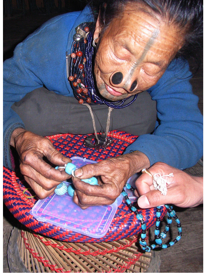
Plate IB. Tani: Apa Tani woman with bamboo nose plugs and facial tattoo examining antique heirloom beads. Apa Tani women only wear their heirloom beads at festivals.