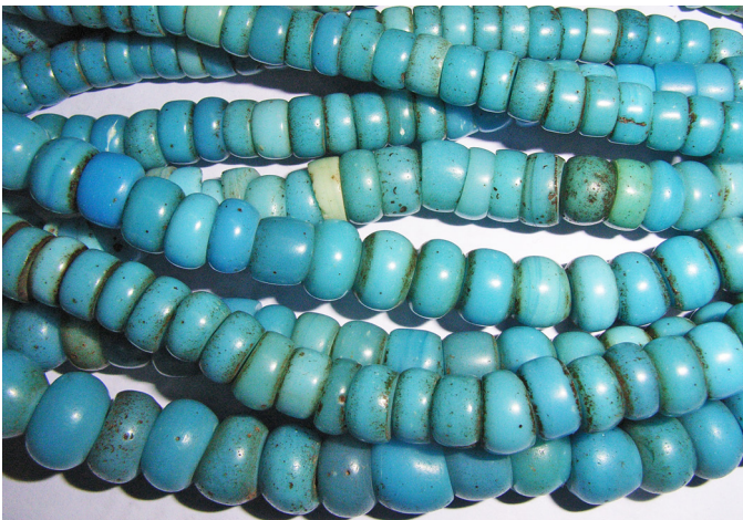
Plate IID. Tani : Top : Chamm dancer dressing, Torgya festival, Tawang monastery. Bottom : Blue glass beads worn bandolier-style by monks at the chamm dance.