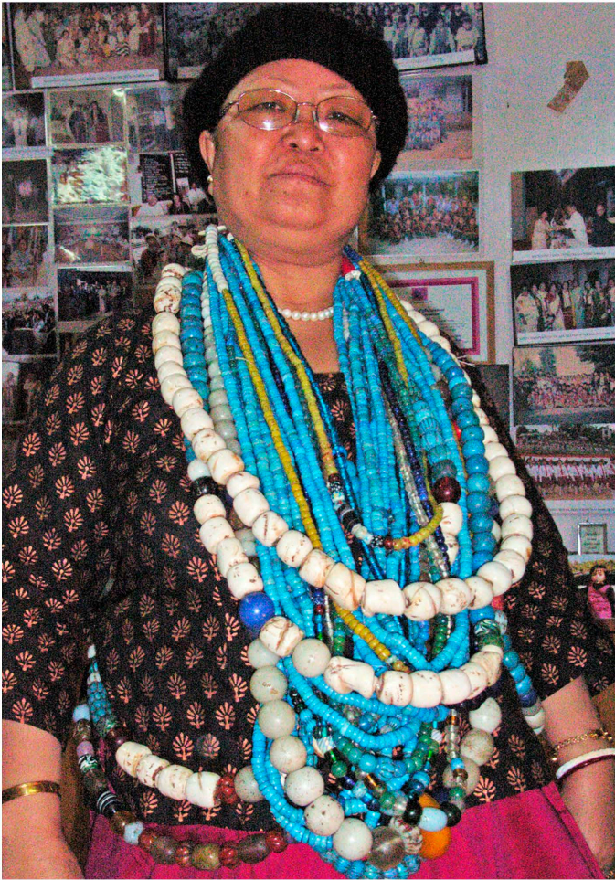
Plate IVB. Tani: A valuable assemblage of antique Tani heirloom beads.