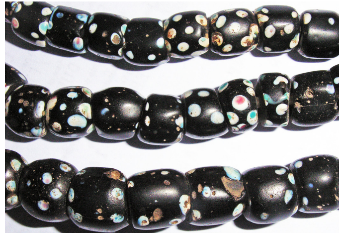
Plate ID. Tani: Top: Much-worn Venetian black eye beads in a Tani heirloom necklace. Bottom: Wound “dogtooth” beads with melon-like lobes.