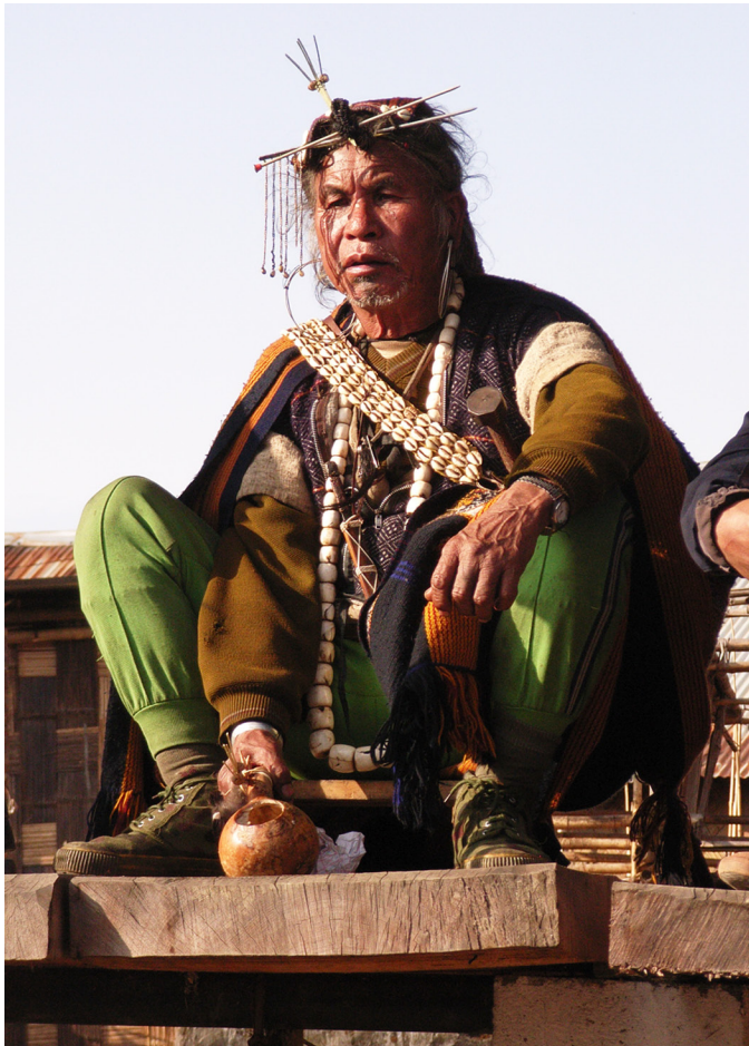
Plate IC. Tani: Apa Tani nyibo (priest) chanting at an animal sacrifice, wearing a much valued antique necklace of conch beads, as well as a band of cowrie shells.