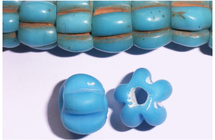
Plate IIIA. Tani: Top: Akha heirloom beads, Chiang Mai, Northern Thailand. Lower beads: possibly late 19th or early 20th century; upper beads: probably much more recent (1990s?). Bottom: Blue wound beads in Kachin heirloom necklaces, Putao, northern Burma.